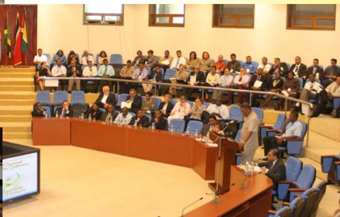
Guyana's Prime Minister, Honourable Samuel Hinds delivers the opening address at the 27th Annual Caribbean Conference of Accountants