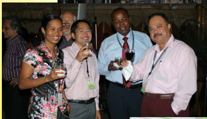
Toast to the El Dorado Rum – voted the Best Rum in the World