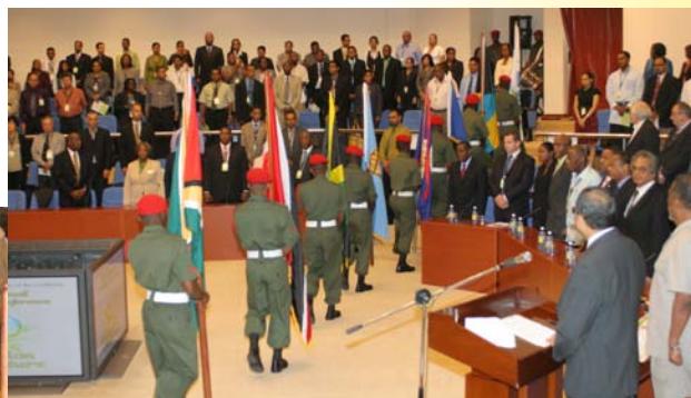
Procession of flags of ICAC member territories during the official opening of the 27th Annual Caribbean Conference of Accountants