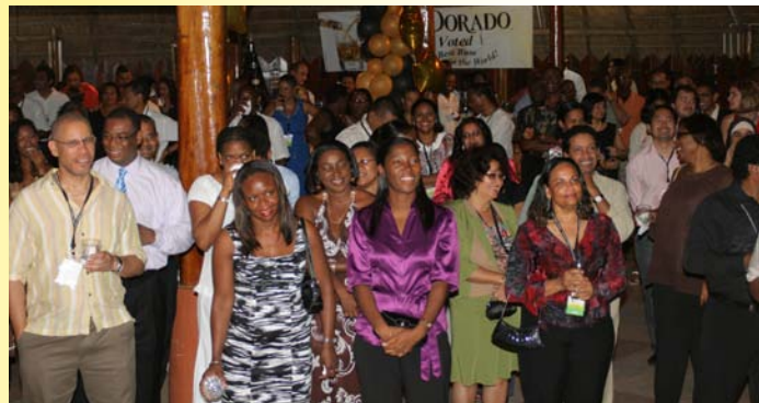
Guests being entertained by Guyana’s steel band at the El Dorado Welcome Reception held on Thursday, June 25, at the Umana Yana

Delegates interact during the cocktail reception for the president’s dinner