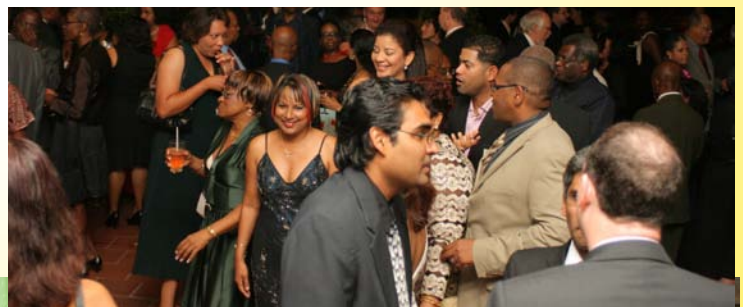
Cacique dance troupe entertains guests at the President’s Dinner held on Friday, June 26, at the Princess Buddy’s Hotel